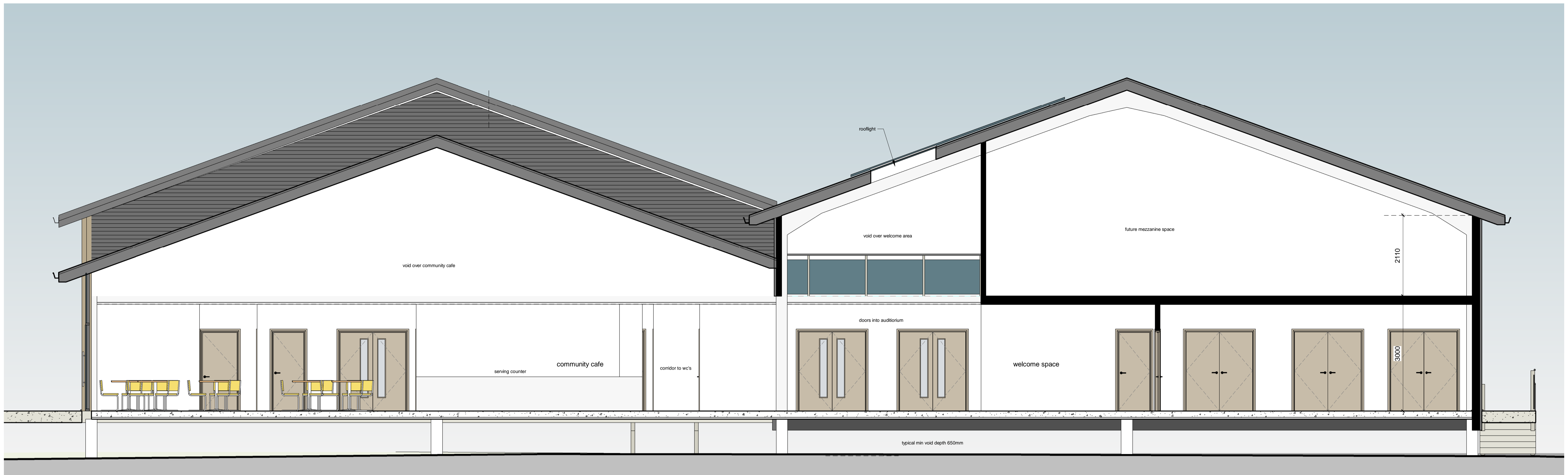
cross-section 1 : 50