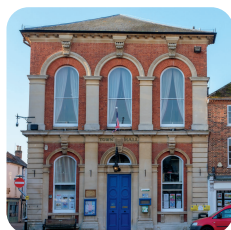
Romsey Town Hall