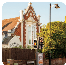
Florence Nightingale Hall

1990s & 2000s The church moves to Crossfield Hall, then Romsey Primary School and Mountbatten School's Lantern Theatre.